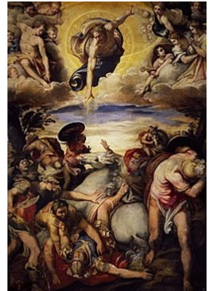
Painting by Taddeo Zuccari (1564)

Spend some time with those words or phrases. What might God be saying to you through them?